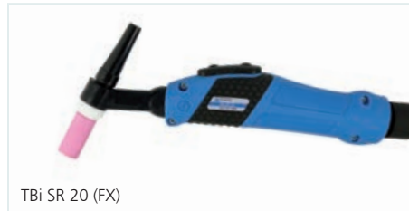
TBi SR 20 (FX)

luftgekühlt / air cooled / refroidissement par air 60% (10 min.) AC: 80 A DC: 110 A Ø 0.5-1.6 mm