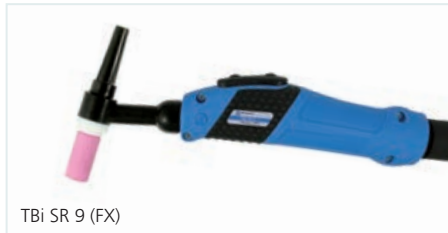
TBi SR 9 (FX)