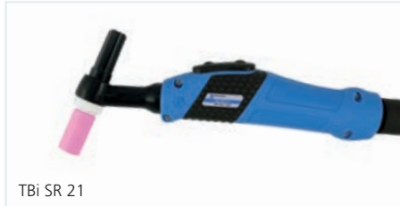
TBi SR 21

wassergekühlt / water cooled / refroidissement par eau 100% (10 min.) AC: 160 A DC: 220 A Ø 0.5-3.2 mm